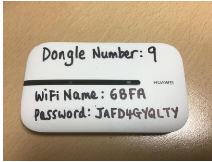
2. Please note the Wi-Fi name and password written on the device.