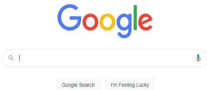
7. You should now be able to access the internet.

If you have any issues with your mobile Wi-Fi router, please do not hesitate to contact the school.