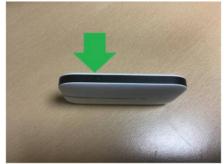
3. Power the device on using the switch on the side.