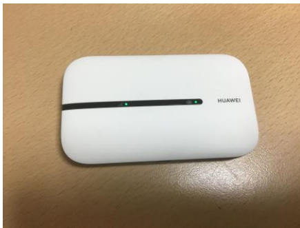
4. Ensure both lights (signal and power) turn green.