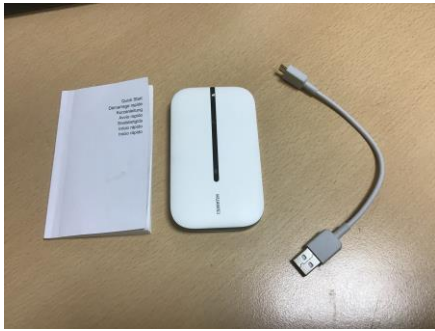
1. Open the box and unbox the contents.

You have been provided with one of the school's mobile Wi-Fi routers (dongles). We will also provide you with a SIM card. Please see the instructions below on how to use this device. You will need to charge the device before you first use it.